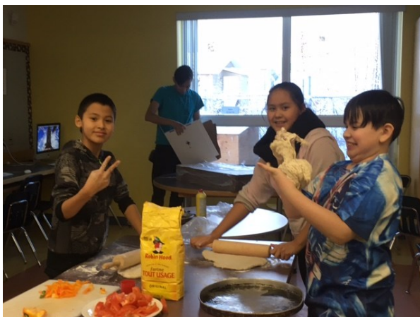
Students Making Pizzas