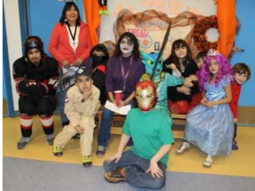
Students and Staff in Costume