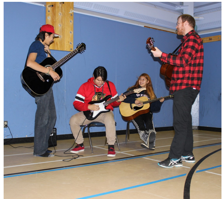
High School Students Performing at Remembrance Day Assembly