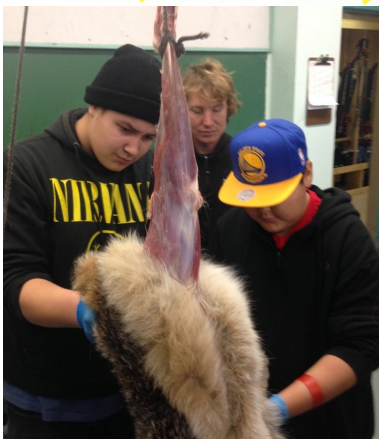
Students Practicing their Skinning