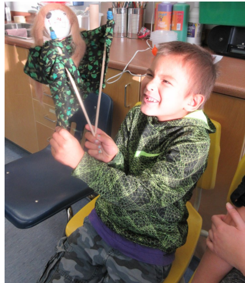
Student Playing with his puppet