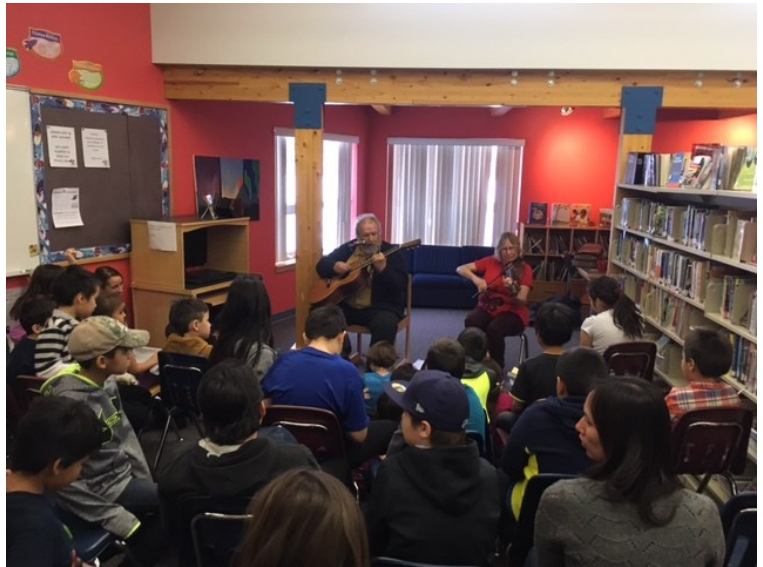
Students Enjoying Musical Performance