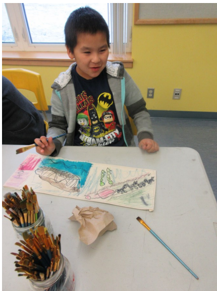
Student painting snake from a story