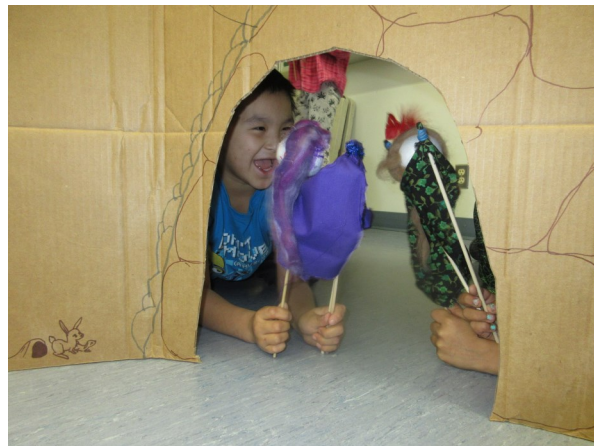
Students Performing Puppet Show