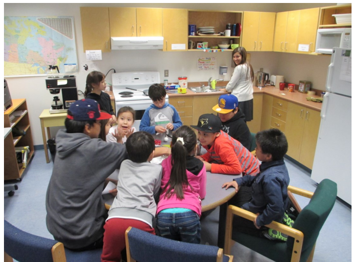
Students Enjoying Delicious Bannock