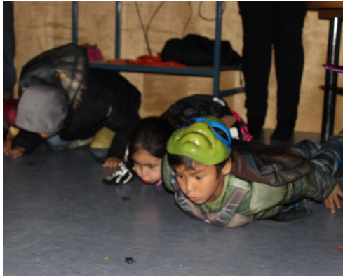
Students having a fun race