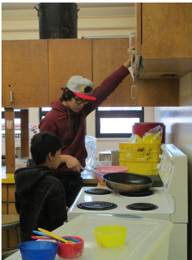
Students Making Bannock