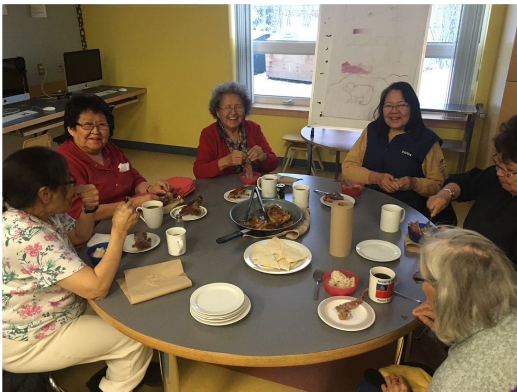
Elders Enjoying a Rabbit Stew Luncheon