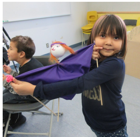
Student showing off her puppet