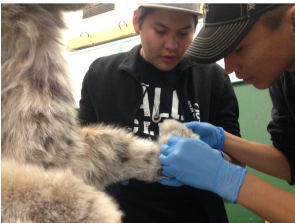
Students Learning how to skin a wolf