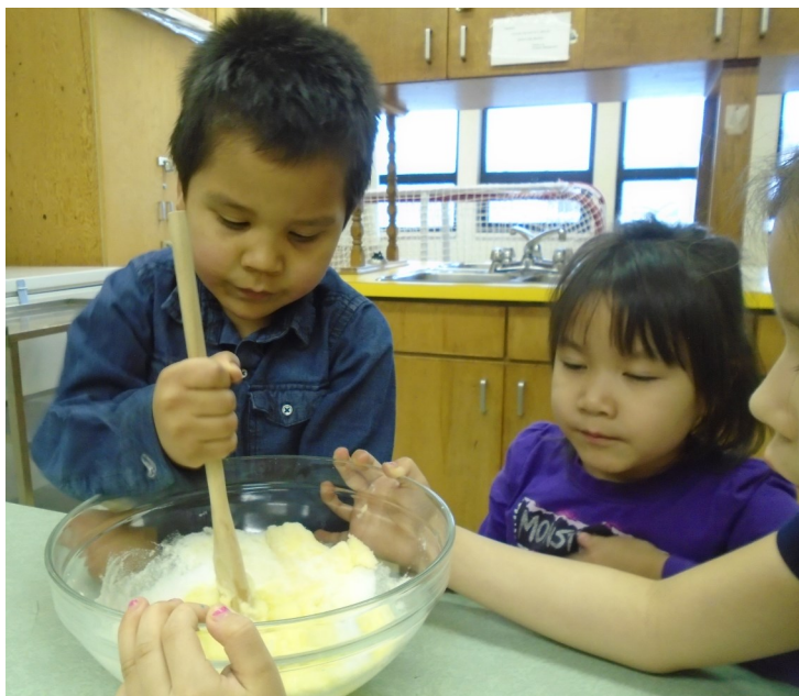
Kindergarten Class Making Cookies