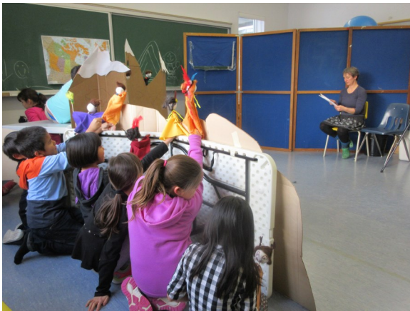
Student s Performing Puppet Show