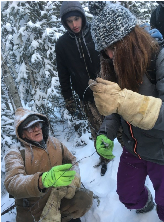
Students Learning to Set a Snare