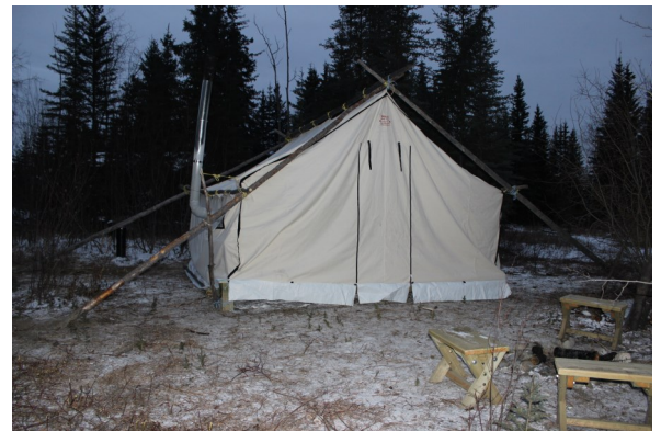
Elder Rachel Tom Tom with students