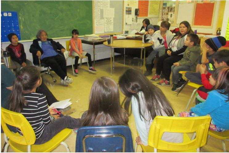
Wall Tent on the edge of School Property