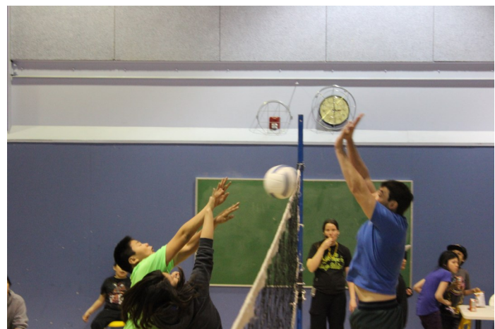
Students and staff face off at the net