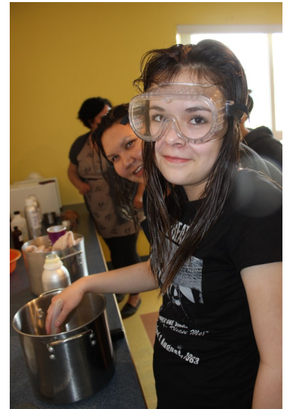
Students Making Soap