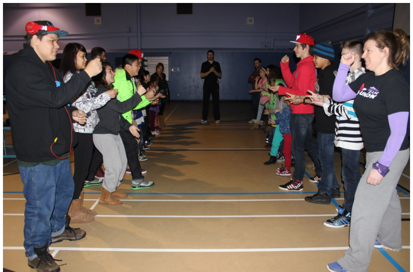
Students Participating in a Game at the Volleyball Clinic