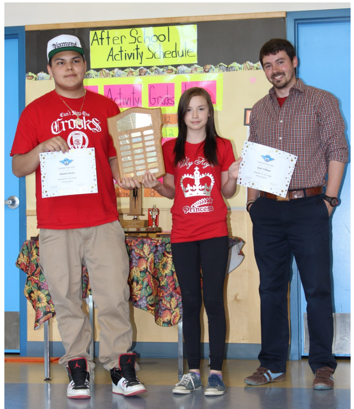
Student of the Year Winners