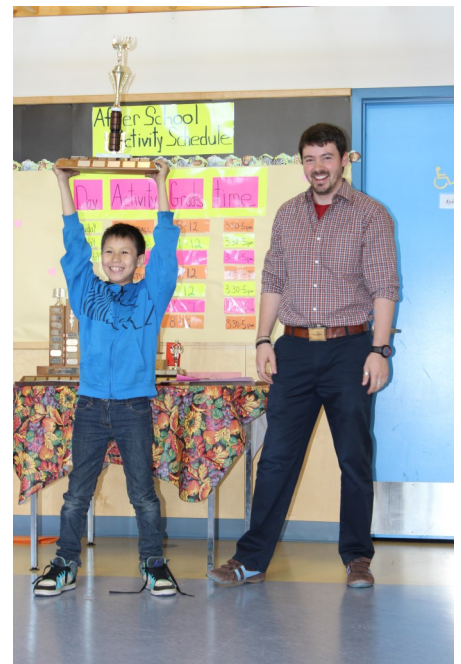
Junior Athlete of the Year Winner