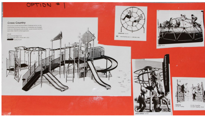
New School Playground Plan