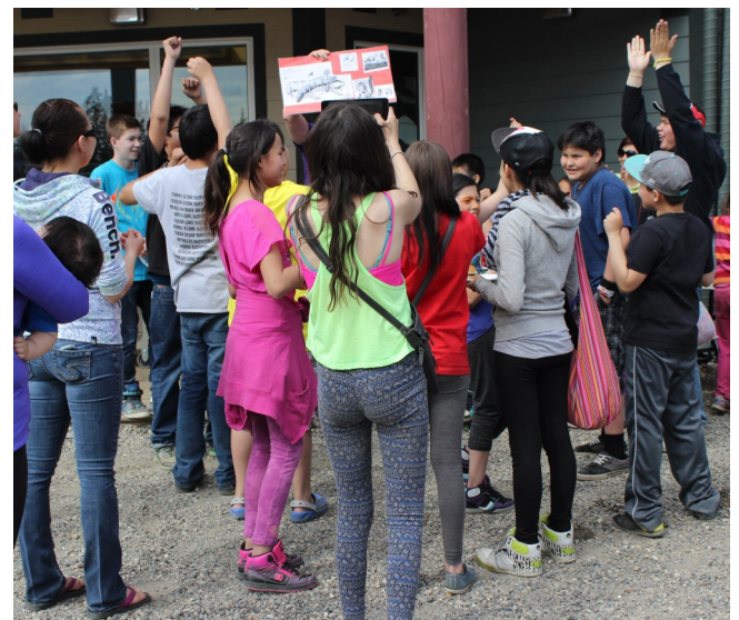
Students Cheering About the New Playground Winner