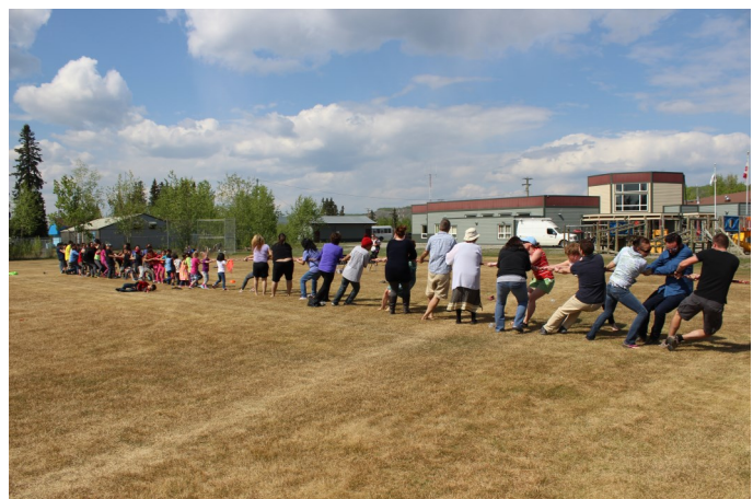
Student vs Staff Tug of War