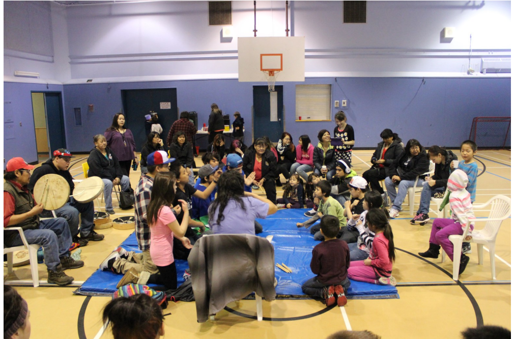
Students Participating in Hand Games Tournament