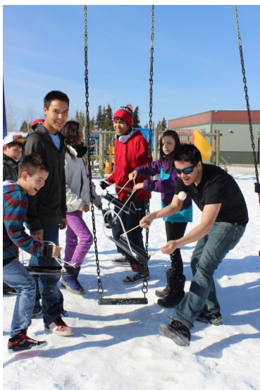
Gutter Ball Fun!