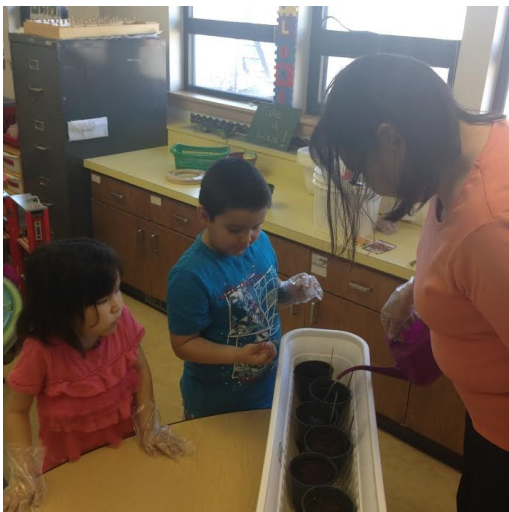
Young Gardeners Tending to their Plants