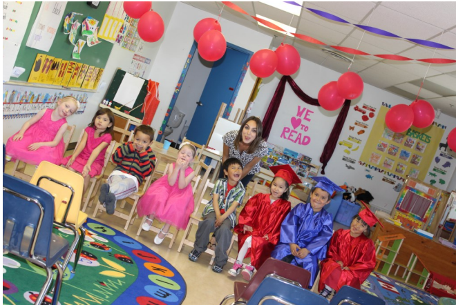
Having Fun at Graduation