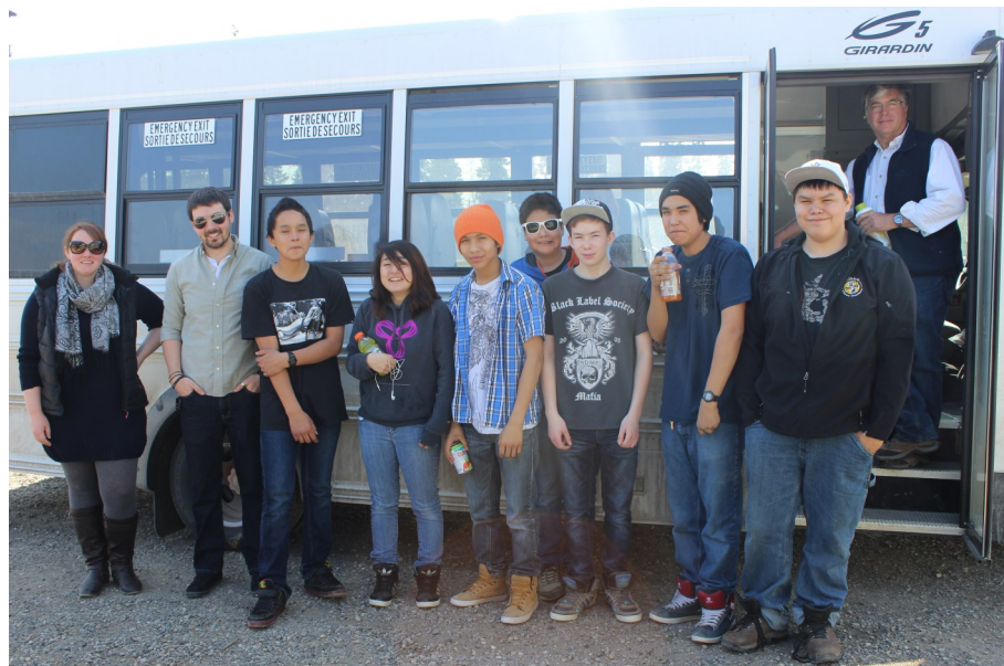
Grade 8-9 Students From EVBS Going to REM in Carmacks