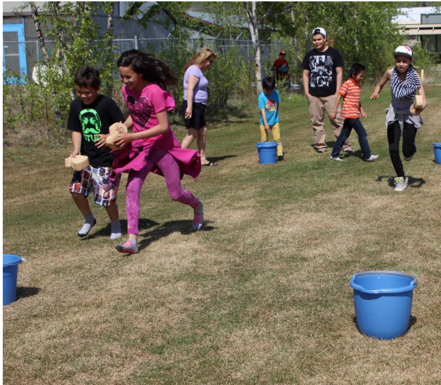
Water Relay Race