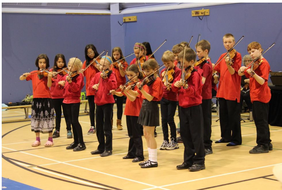
Fiddleheads Group Performing in the EVBS Gymnasium