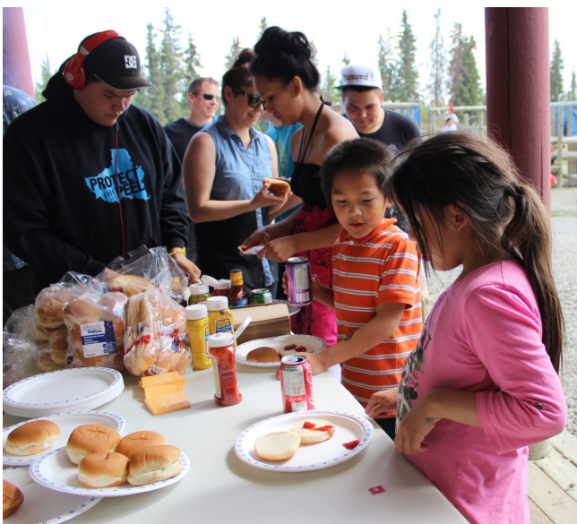
BBQ Hosted by School Council