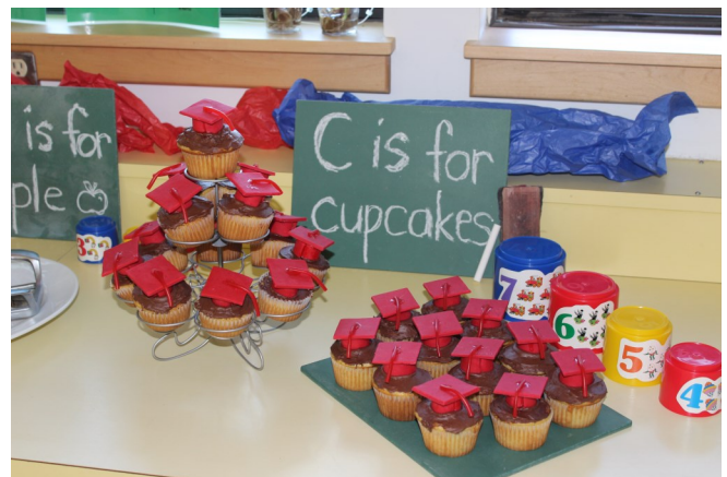
Delicious Treats Prepared by the Kindergarten Class