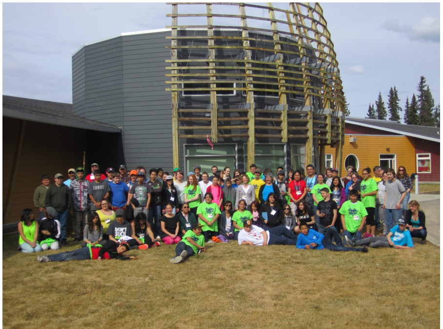
Grade 8-9 Students From All Yukon Rural Communities at REM in Carmacks