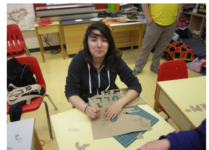
Screen Printing Workshop