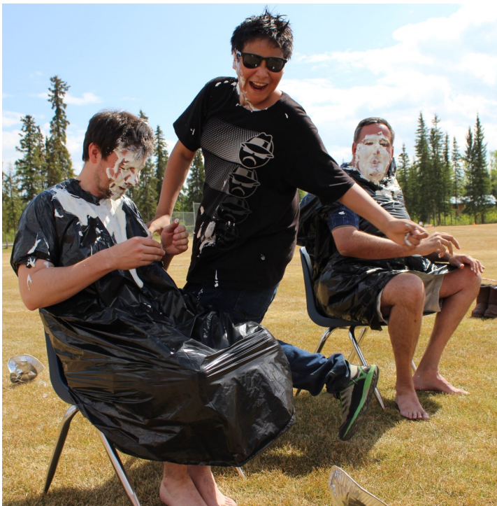
Pie the Principals!