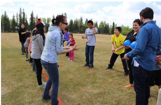
Water Balloon Toss