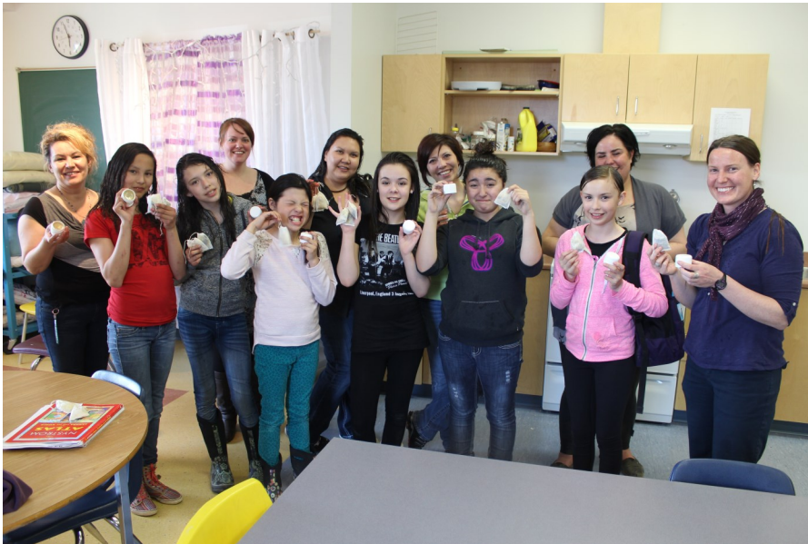
Students Showing off their Homemade Soap and Lip Balm