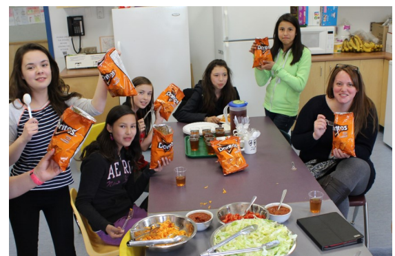
Students Making Tacos in a Bag