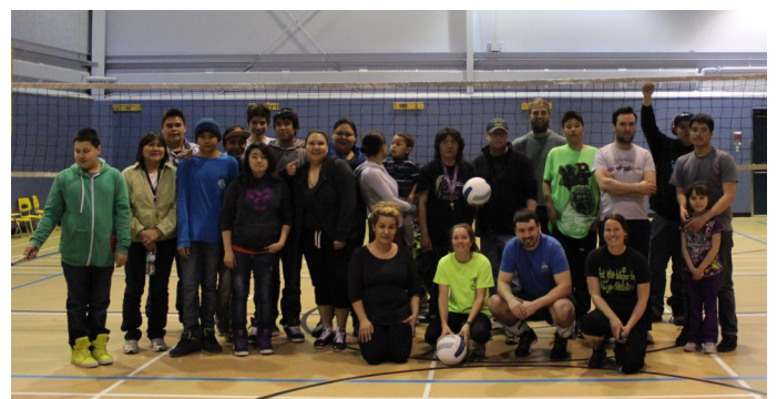
Students and Staff at Volleyball Game