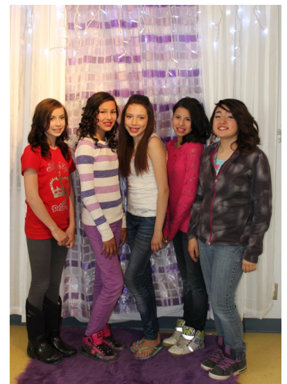
Hair & Esthetics Photo Shoot