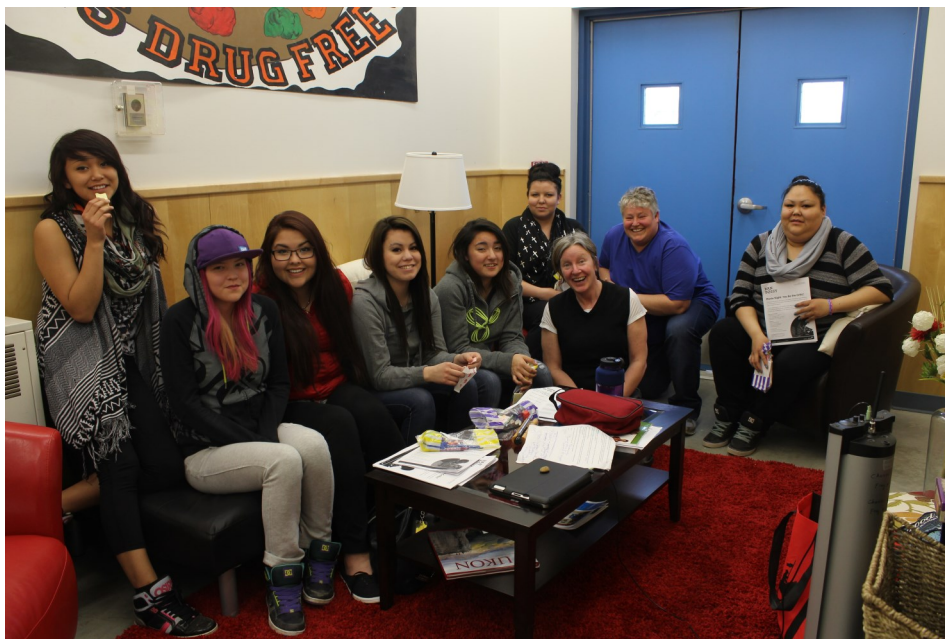
Grade 8-12 Girls Attending the Gender Stereotypes Workshop in the SSU