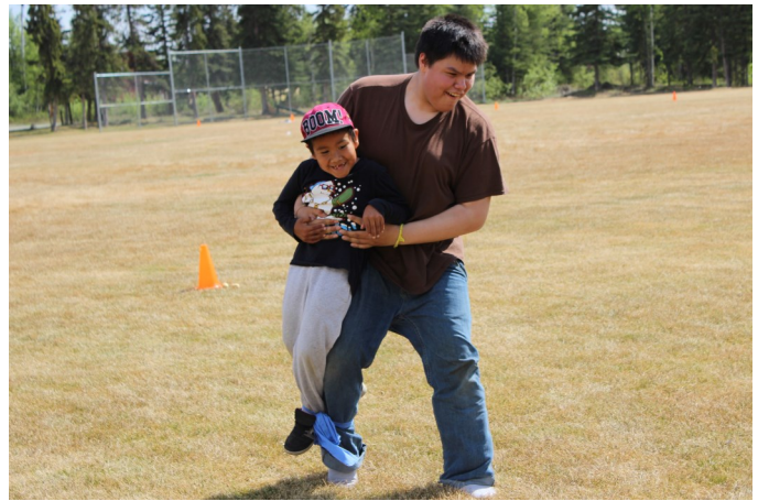
Three Legged Race