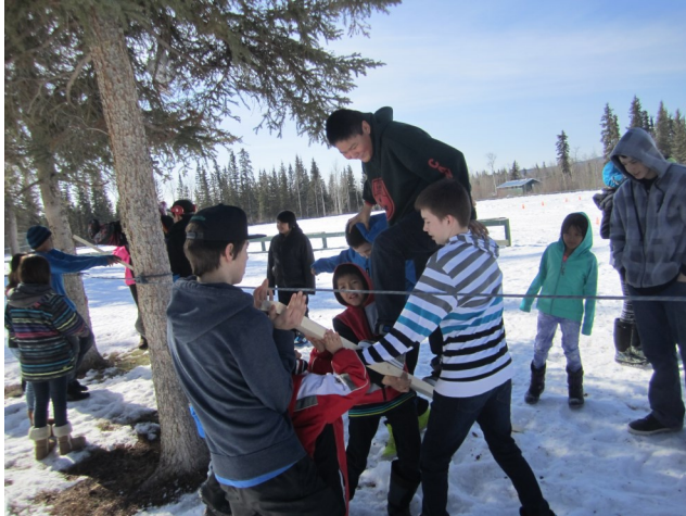
Students working together at the First Annual Cabin Fever Challenge !