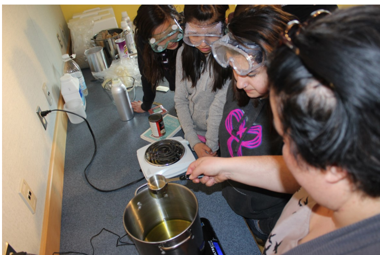
Students Making Homemade Soap