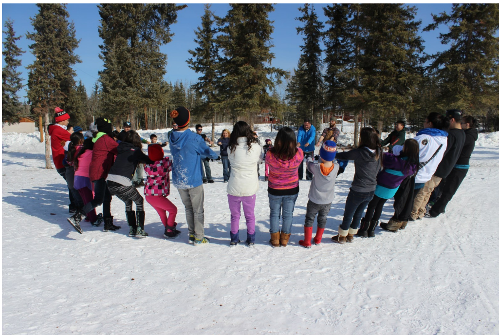
Students and Staff Working Together at the Cabin Fever Challenge!