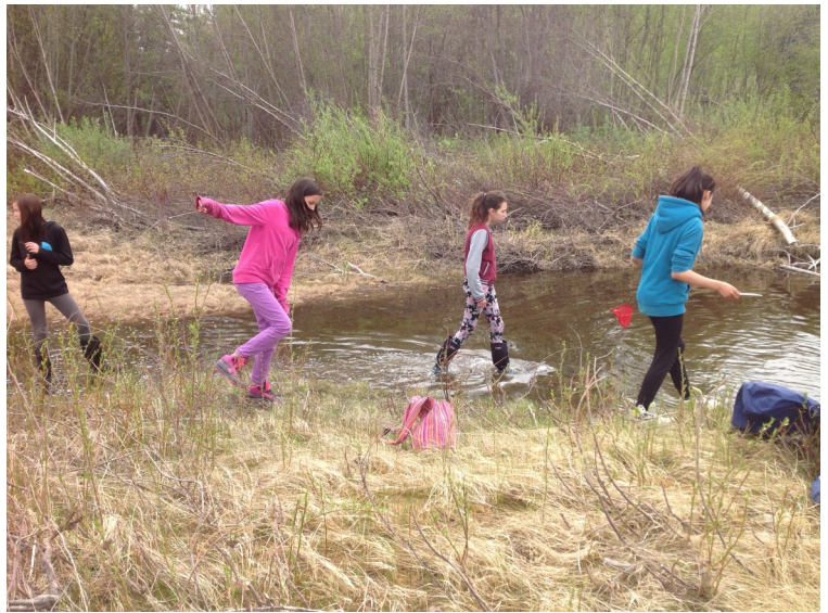
Students Releasing Salmon into Tatchun Creek