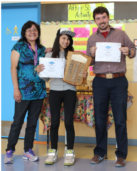
Northern Tutchone Award Winner