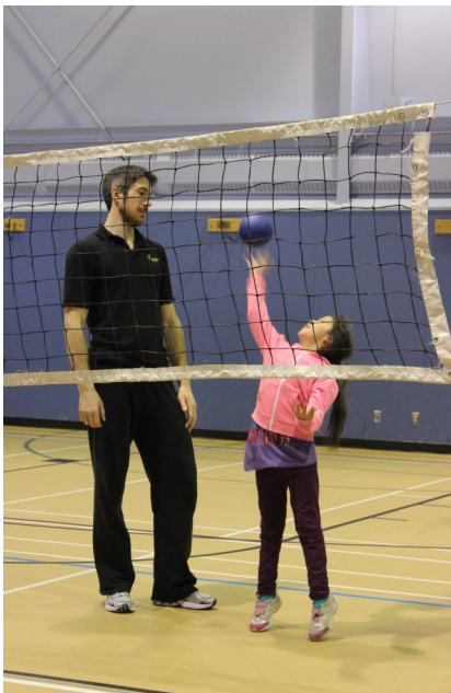
Student Learning to Spike